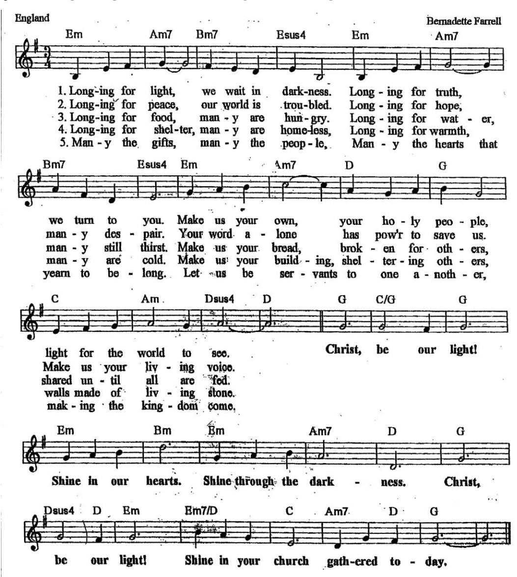
Please see the next page.

Closing Song Christ Be Our Light – All sing verses 1, 2 and 4.